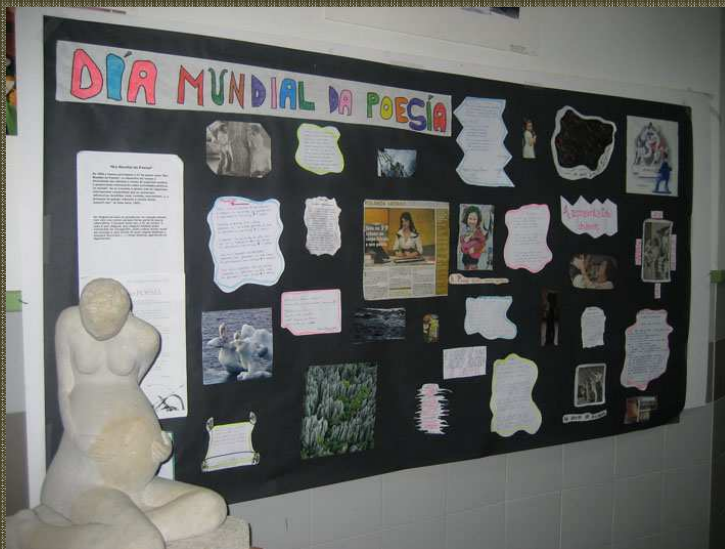
World Poetry Day