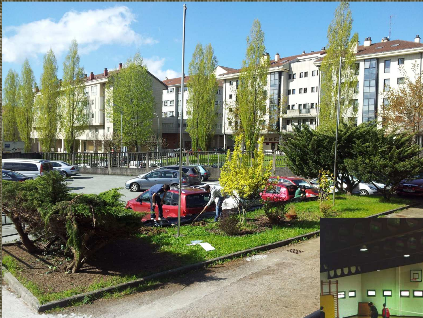
Farming aromatic plants in the school front yard.