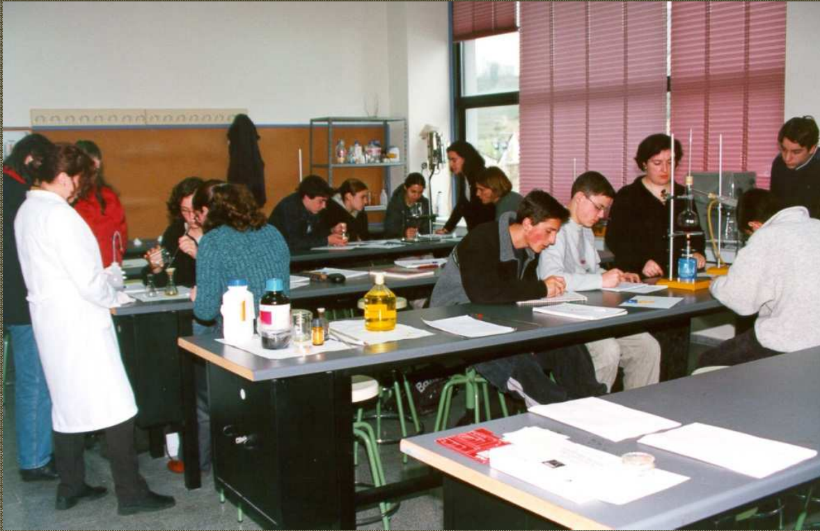
Students in the chemistry laboratory