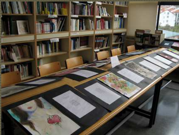
Exhibition of Pablo Neruda poems.