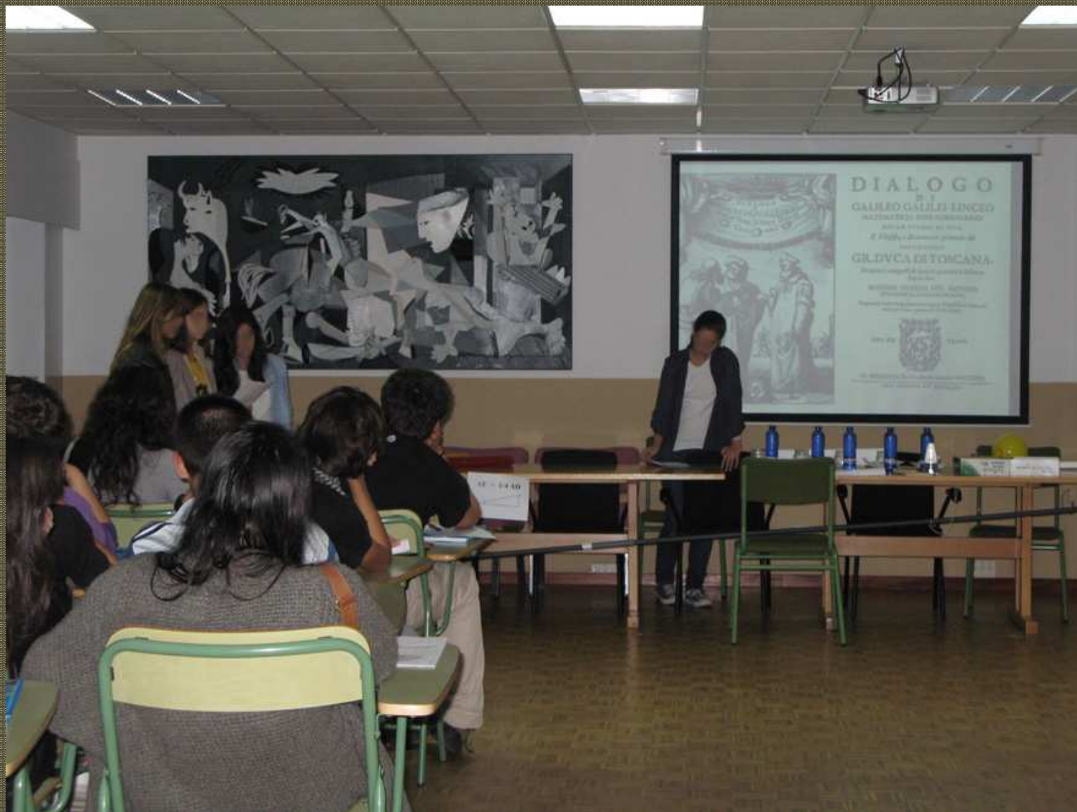
School Assembly Hall during a conference. On the left, an interpretation of the Guernica painting by Picasso, made of fibreboard by Arts students.