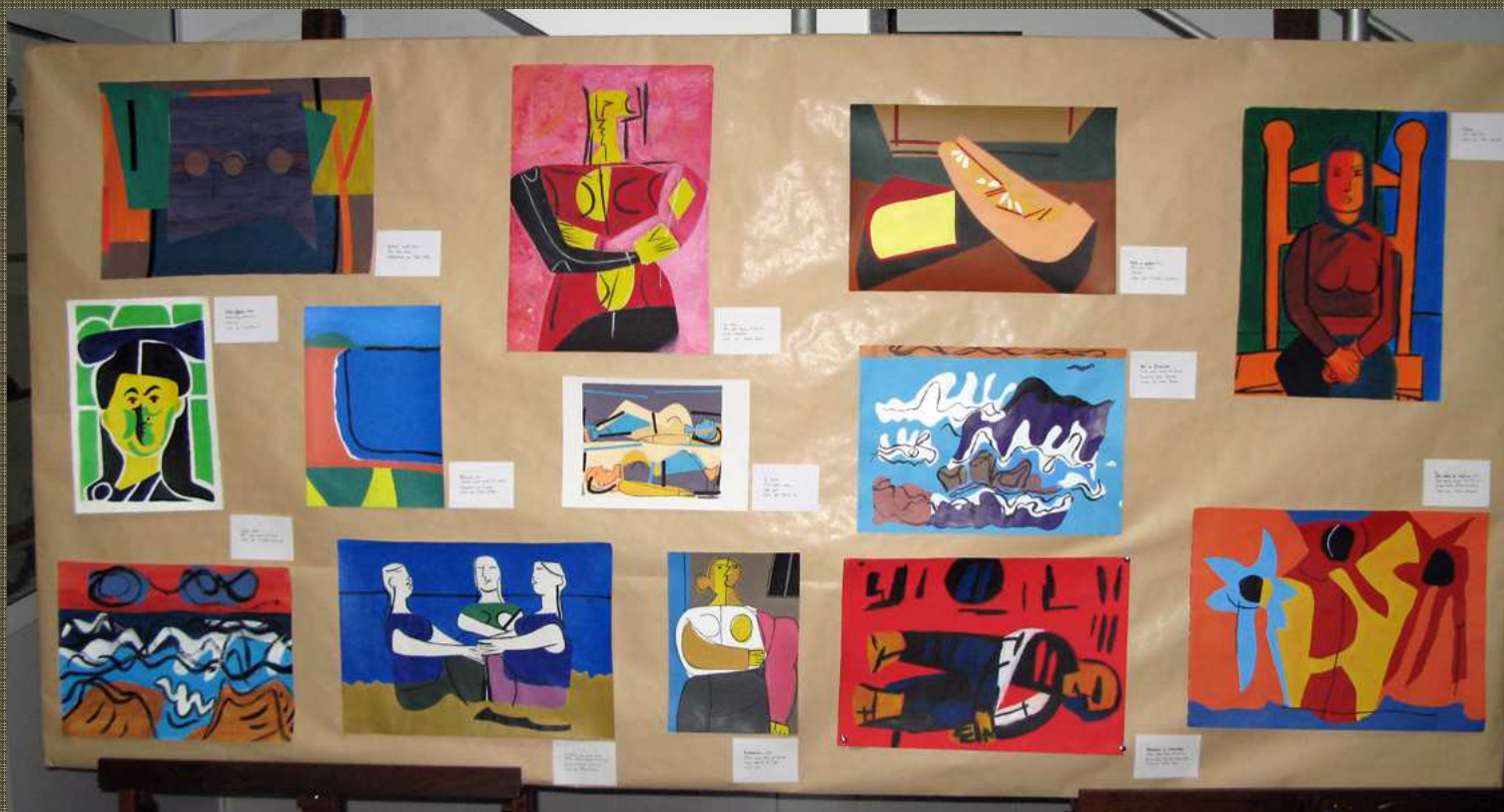
Acrylic paintings by Art students.