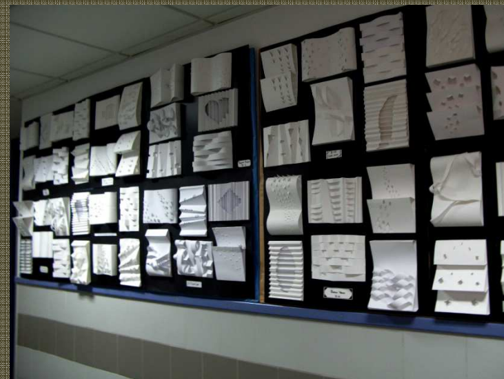
Mural with fibreboard works