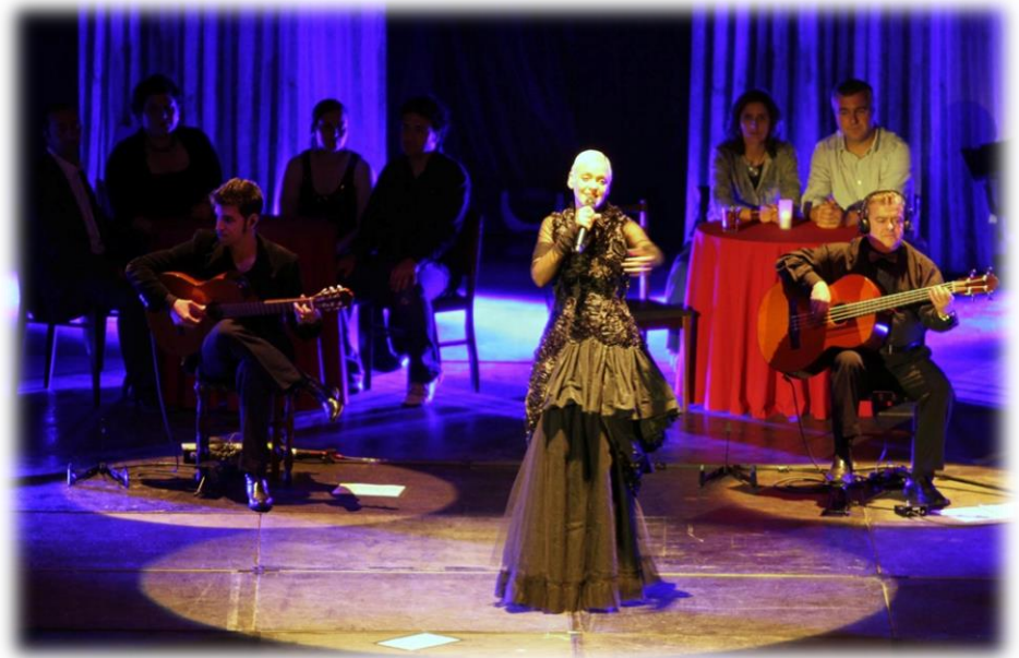
Mariza singing the fado “Chuva”