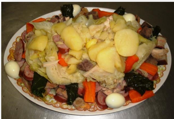
Cozido à Portuguesa (boiled meat and vegetables)

The most famous wine in Portugal is Porto Wine but we also have excellent table wines.