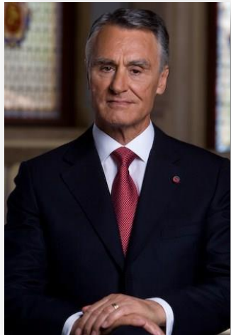
The President Aníbal Cavaco Silva