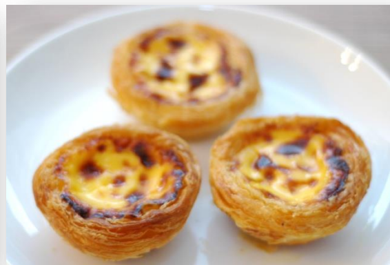
Pastéis de nata (creamcake)