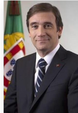
Prime Minister Pedro Passos Coelho