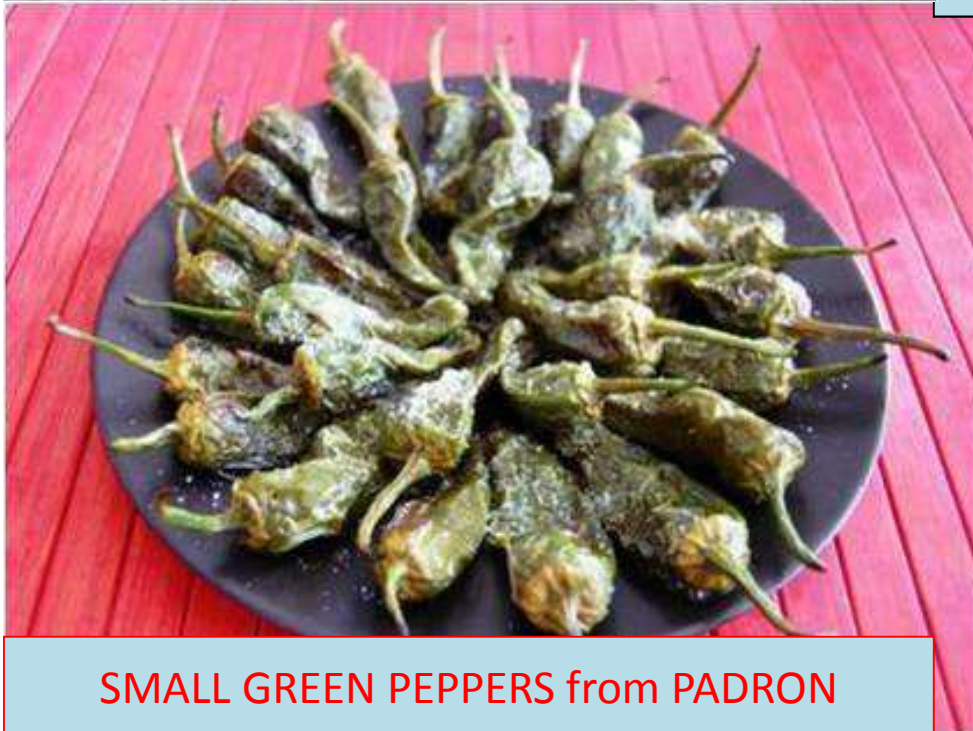
SMALL GREEN PEPPERS from PADRON