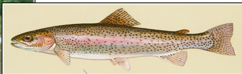
Trout, ( pstrąg in Polish)