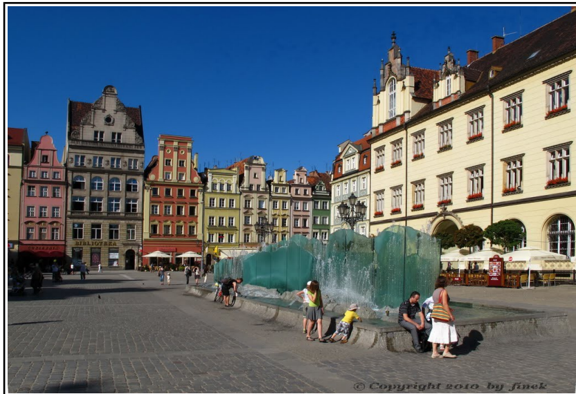
Fountain on the Market Square