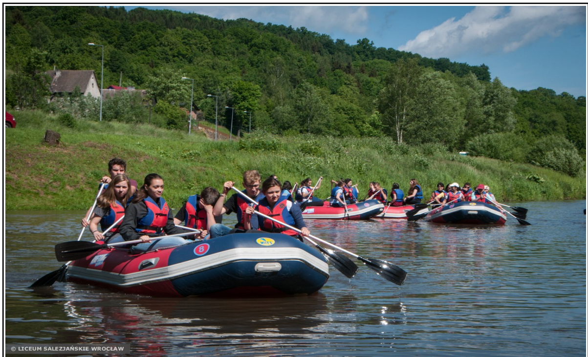
Rafting by Nysa Klodzka