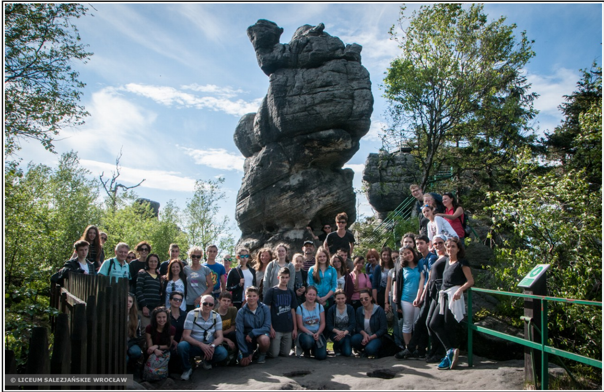
On the top of Szczeliniec