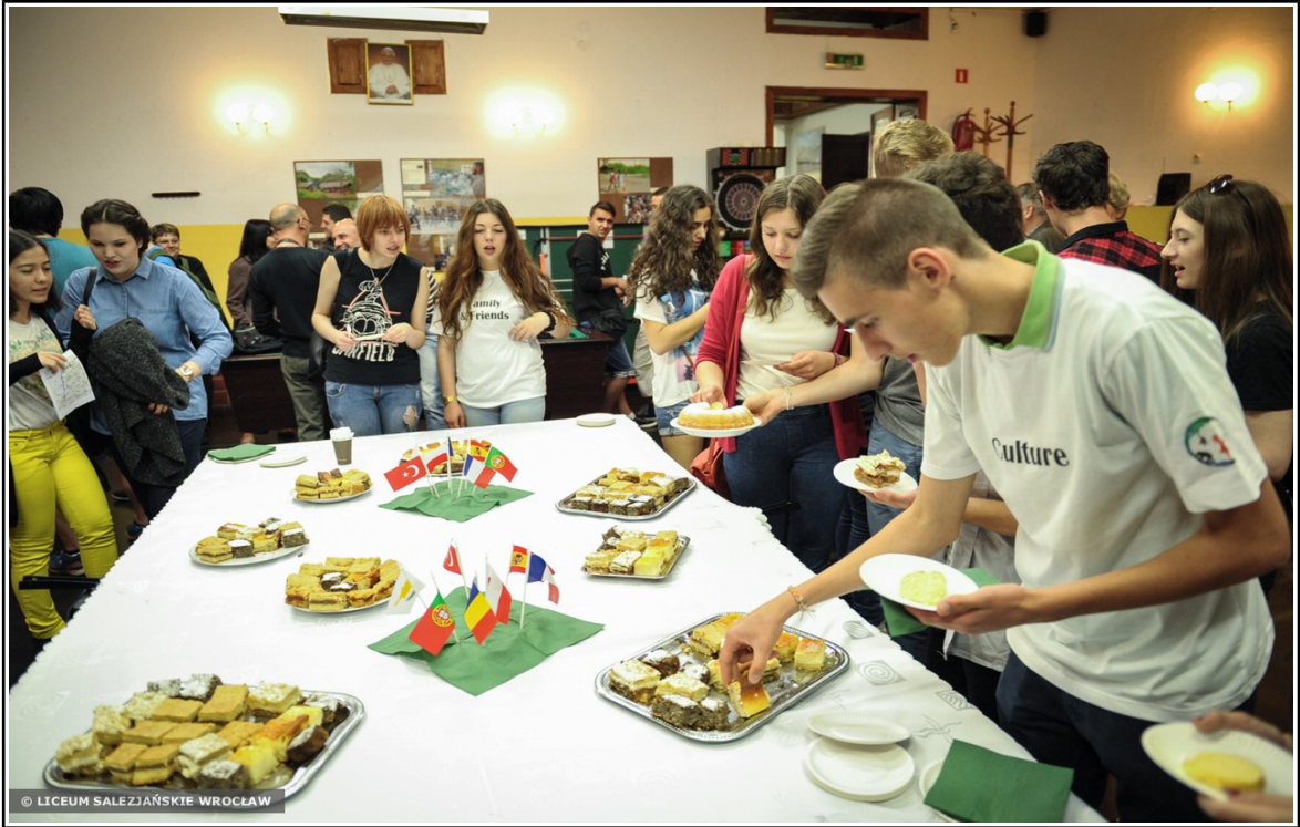
The official welcome at school hall