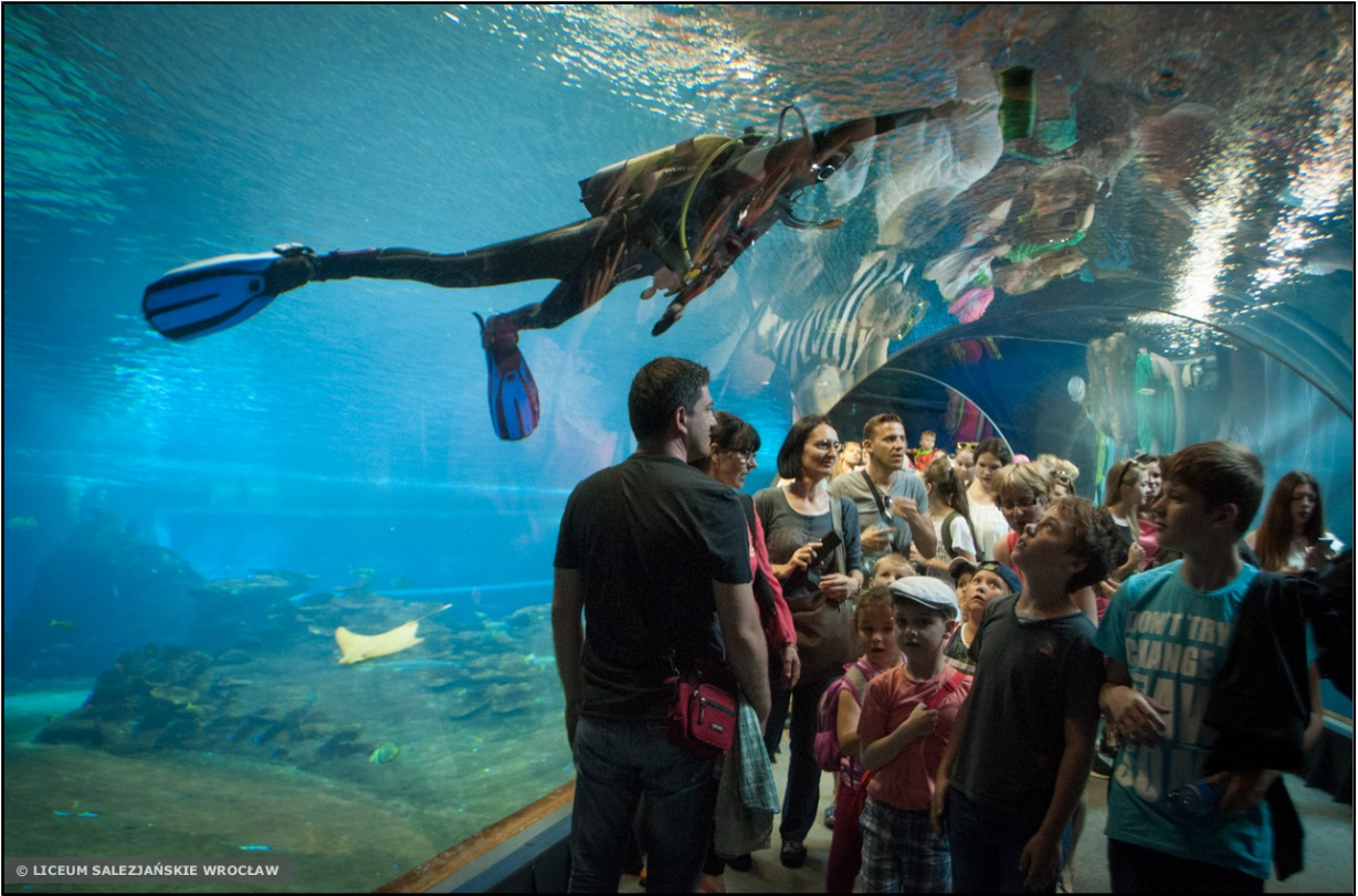
The visit in Afrykarium