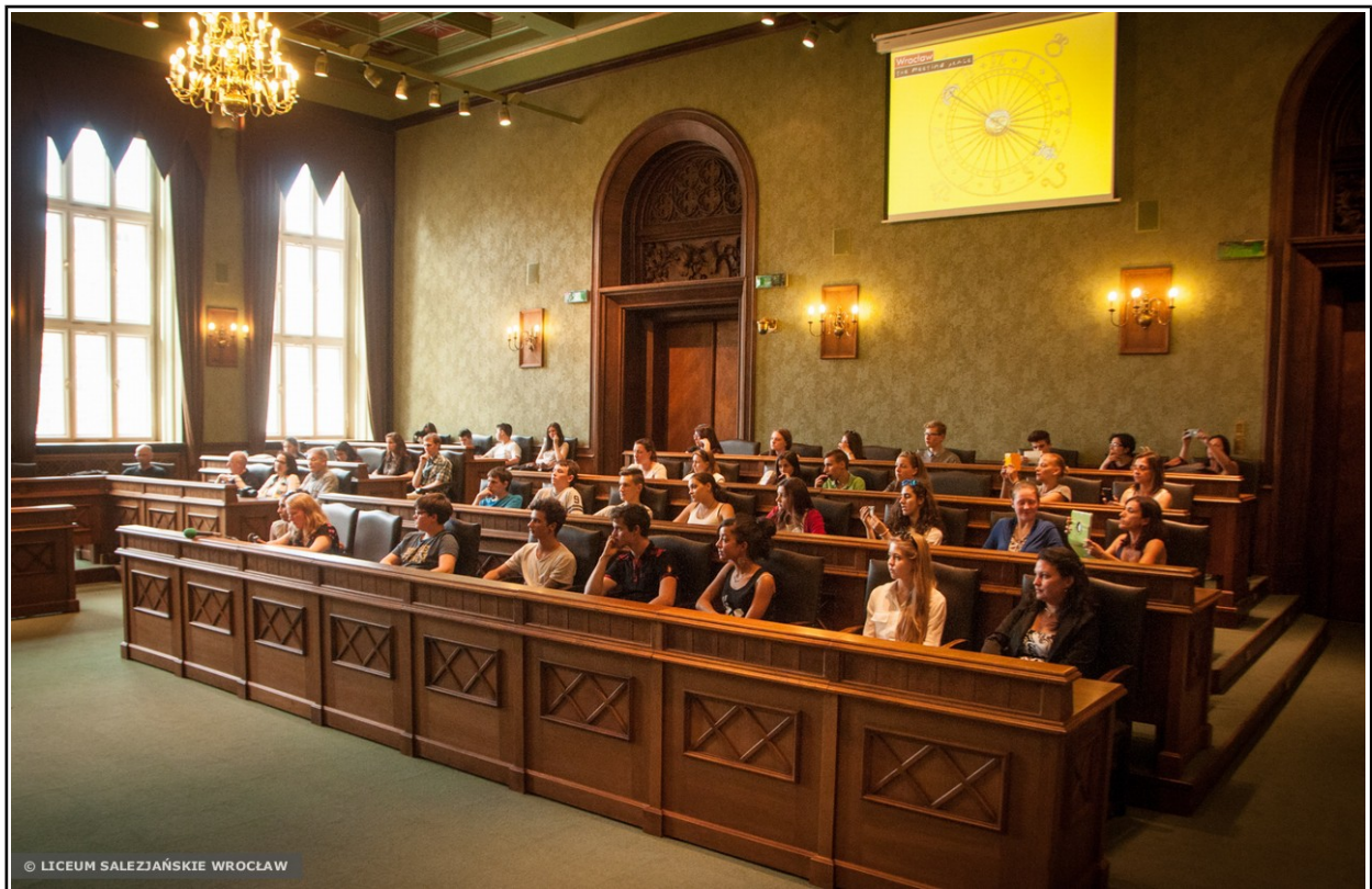
The meeting with the mayor of Wrocław