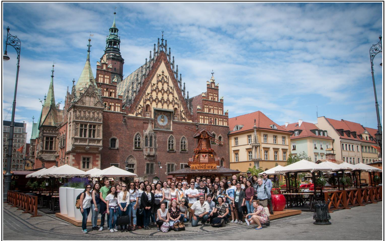
The visiting of market square.