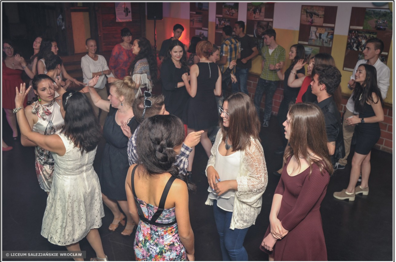
Party and dinner